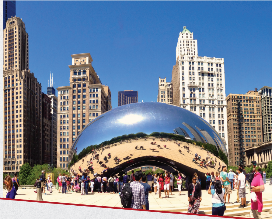
BELOW: More widely known as "The Bean," this popular Chicago landmark and photo spot is actually named Cloud Gate. It is located in Millennium Park in downtown Chicago and is a public sculpture created by British artist Anish Kapoor. Cloud Gate is 66 feet long, 33 feet high and weighs more than 110 tons. Its mirror-like appearance offers great reflections of the Chicago skyline. It is a signature landmark in Chicago.