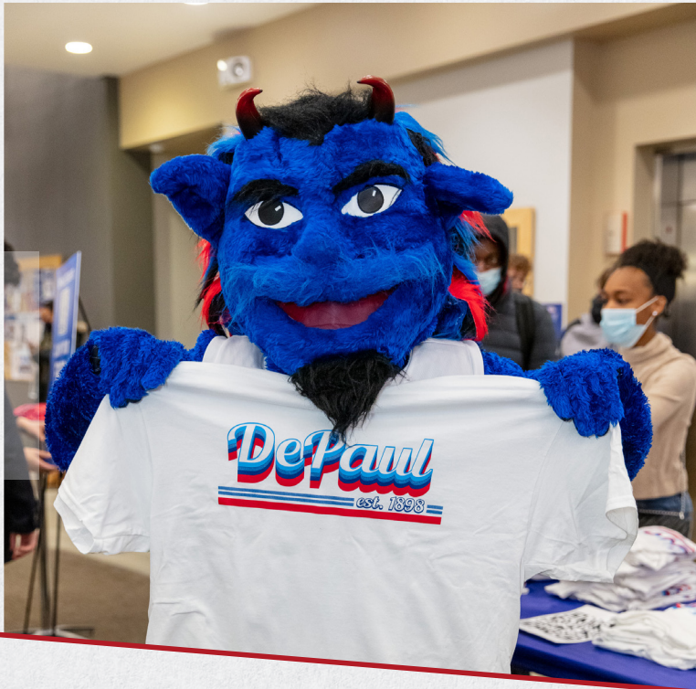
ABOVE: DIBS, or Demon in a Blue Suit, the DePaul Athletics mascot, brings the spirit to an event in the Lincoln Park Student Center atrium, where many university events take place.