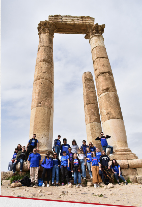
ABOVE: DePaul first-year students and their faculty leaders on a spring break study abroad program in Jordan. DePaul offers a variety of FY@broad programs each year, which are short study abroad experiences specifically for first-year students, with special scholarship funding.