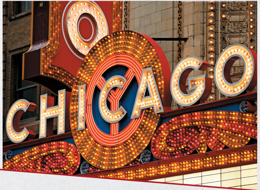
BELOW: The famous Chicago Theatre, a signature landmark of the city.