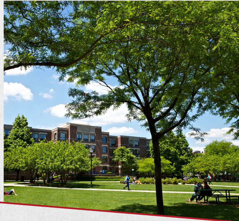
BELOW: The Quad, located in the center of campus between Richardson Library, Schmitt Academic Center, McGowan North and University Hall. The Quad is one of the most popular spots on campus. Students often gather here to study and hang out. It also is a main thoroughfare of campus.