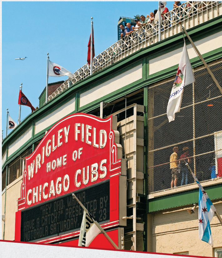
ABOVE: Go Cubs Go! Located just two "L" stops north of the Lincoln Park Campus, Wrigley Field is home of the Chicago Cubs, a team popular with many in the DePaul community.