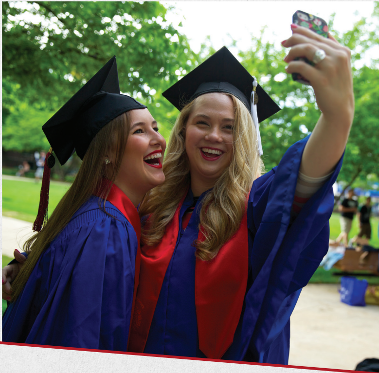
ABOVE: Graduation is a proud day of celebration for students, families, faculty and staff. DePaul graduates between 5,300 and 5,500 students annually.