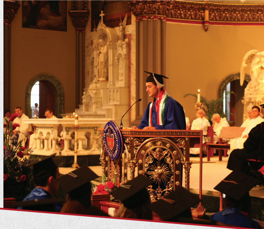
BELOW: Many events take place to commemorate graduation at DePaul University, including the Baccalaureate Mass held at St. Vincent de Paul Church.