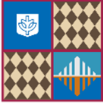
THE THEATRE SCHOOL