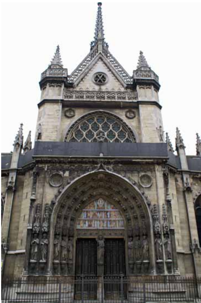
Saint Laurent Church Paris