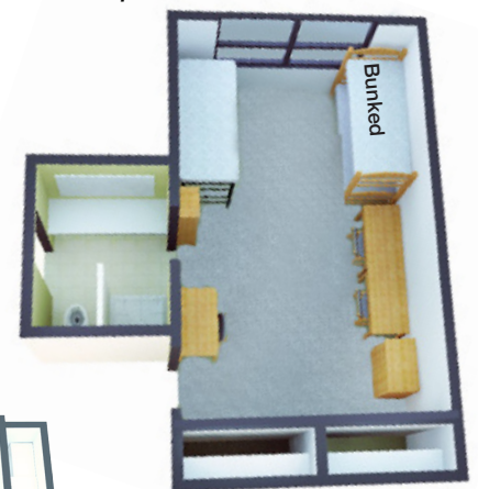
Example: Clifton-Fullerton Hall