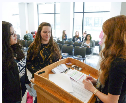
Pictured above: A past room selection

During the first week in April, residents who have completed an agreement will receive a room selection packet and appointment time in their campus mailbox.