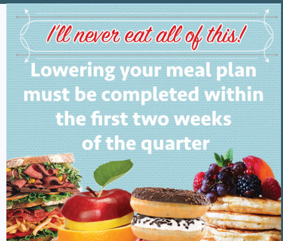
Pictured above: An ad reminding residents about meal plan deadlines.

For more details about meal plan requirements, including minimums and rates, visit go.depaul.edu/mealplans .