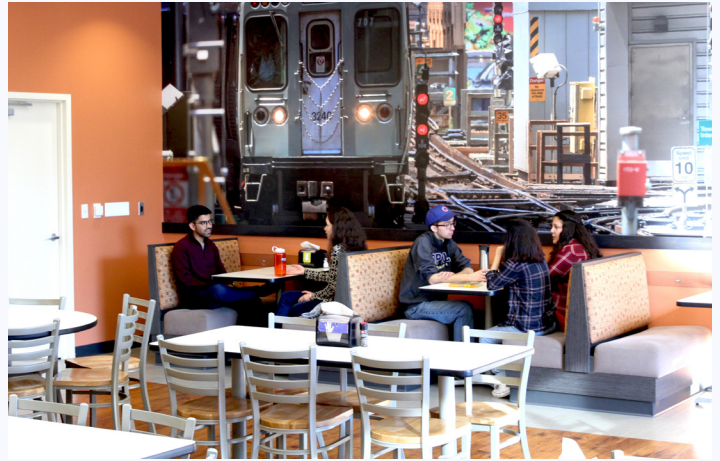
Pictured above: The University Center dining center. Below: Students at the nearby L station and in the center's rooms.

Residents are welcome to live on one campus during their first year and request to live on the other for the second year. Students may attend either room selection for their preferred campus: April 11 for University Center (Loop) or April 18 – 20 for Lincoln Park.