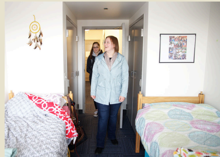
Pictured above: Two students walk through a potential unit.