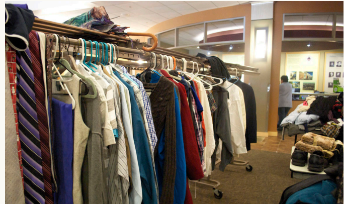
Pictured above: The SWAP shop resells donations from residents, raising money for DePaul Mission and Values.

Please remind your student to donate any reusable items at donation locations in the residence halls June 6 – 10 between noon and 4 p.m. The SWAP shop will take place in the Lincoln Park Student Center Room 120 on Wednesday, June 15, from 10 a.m. to 3 p.m. For more information, visit our website at tinyurl.com/demonswapshop .