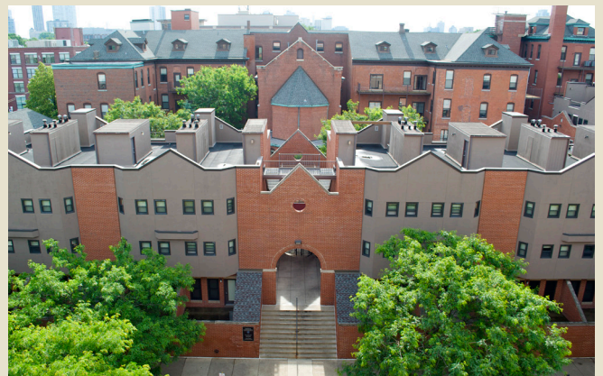
Pictured Above: A photo of Sanctuary Hall and Townhomes, two of DePaul's apartment-style housing options

Students studying abroad next fall who would like to return for the winter quarter should complete the housing agreement through Campus Connect and email our office stating they would like their agreement to begin winter quarter. Failure to notify housing of a winter quarter start date may be associated with a fee. Winter quarter confirmations and assignments will be made in December and students will be notified.