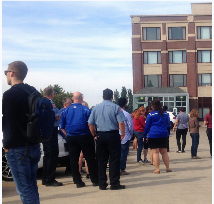
Pictured above: Residents participate in a fire drill.

Should Lincoln Park student housing staff discover any prohibited items in a unit, they may remove them or disable them with an appliance-locking device on sight. Additionally, residents may be cited for an electrical violation. Some violations incur a $150 fee (covered smoke detectors, burning candles, etc.). We encourage parents and guardians to talk to students about fire safety and the importance of understanding prohibited items in housing.